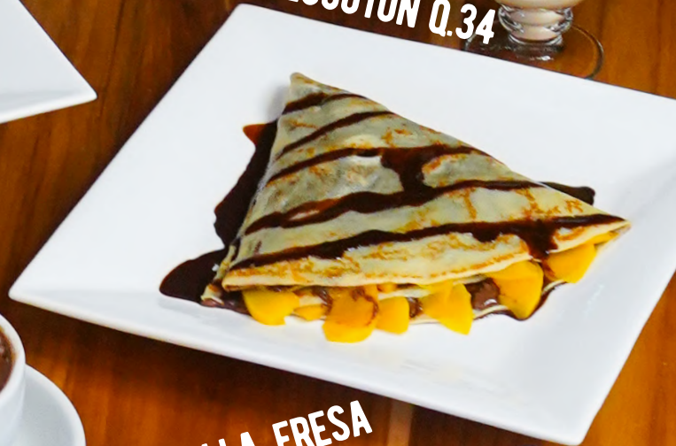
NUTELLA, FRESA Y BANANO Q.35