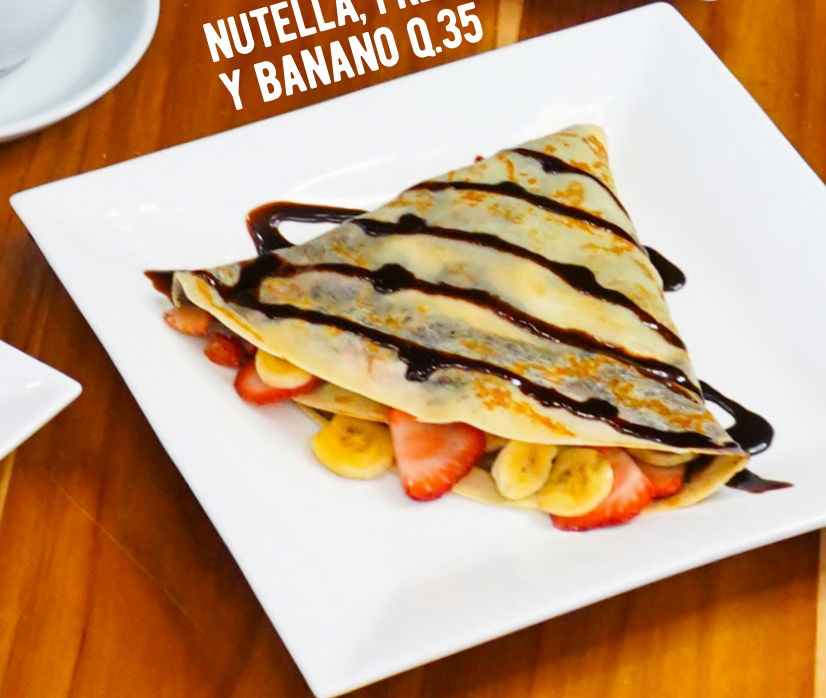
NUTELLA, FRESA Y BANANO Q.35