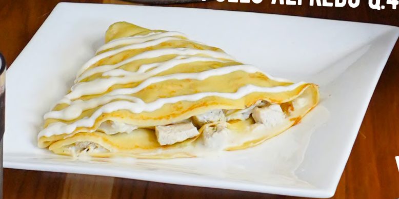
POLLO ALFREDO Q.41