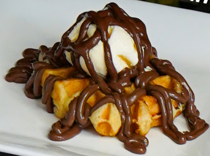
CASTOR'S WAFFLE Q.35