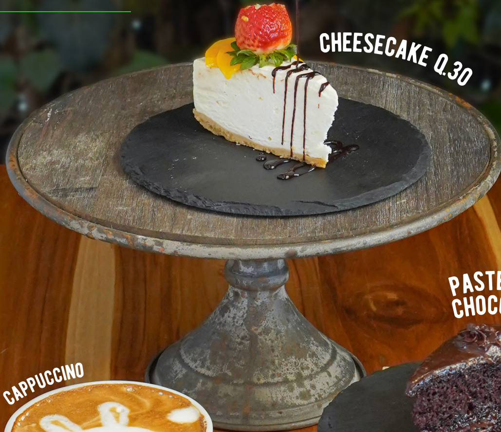
PASTEL DE CHOCOLATE Q.30