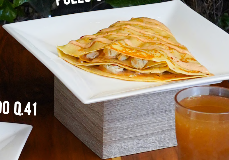
POLLO ALFREDO Q.41