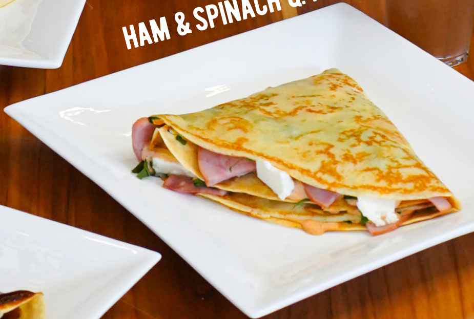
HAM & SPINACH Q.41