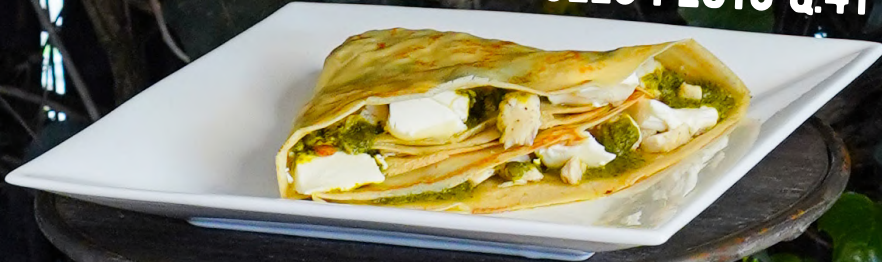
POLLO PESTO Q.41