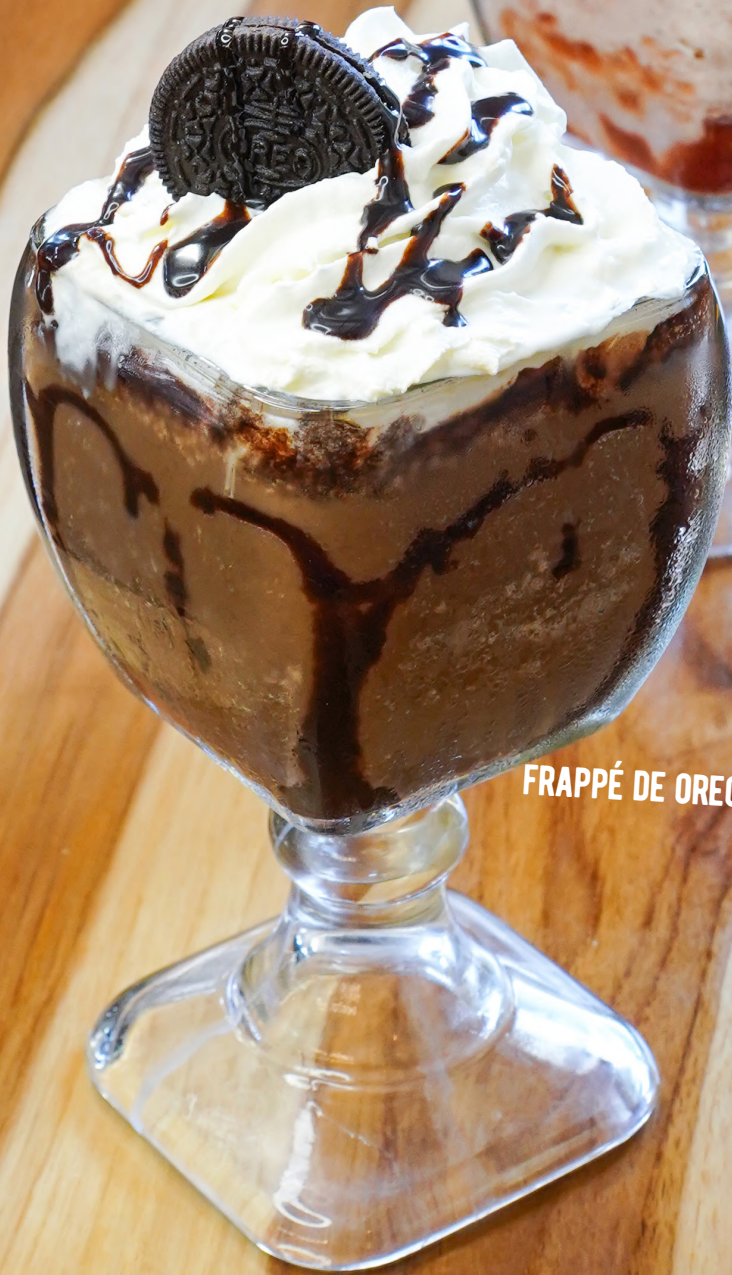
FRAPPÉ DE OREO